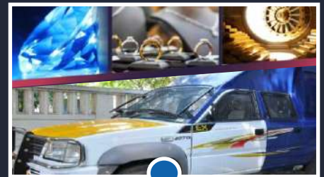
RADIANT VALUABLES LOGISTICS A DIVISION OF RCMS LTD

Regd. Office : No.28, Vijayaragava Road, T.Nagar, Chennai - 600017 Ph: 044 28155448 / 6448 / 7448. Fax: 044 28153512