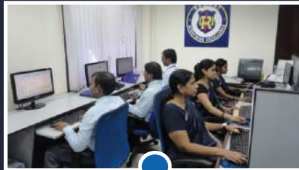
RADIANT BUSINESS SOLUTIONS PVT LTD