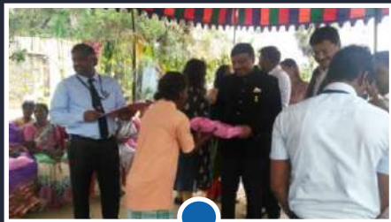
RADIANT's CSR INITIATIVES