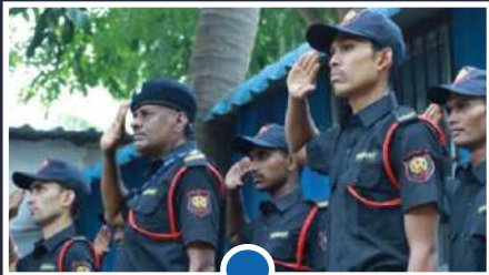
RADIANT PROTECTION FORCE PVT LTD