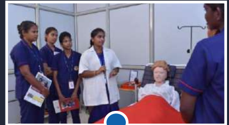
RADIANT MEDICAL SERVICES PVT LTD