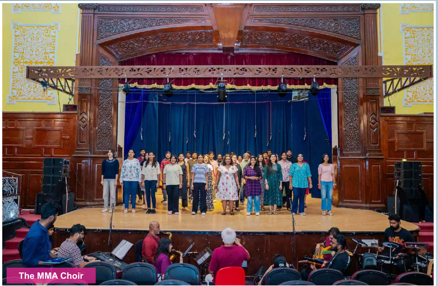
The MMA Choir