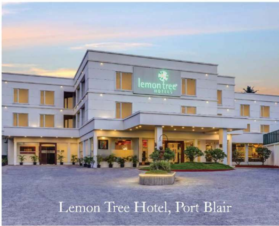
Lemon Tree Hotel, Port Blair