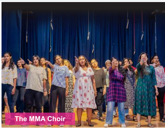
The MMA Choir