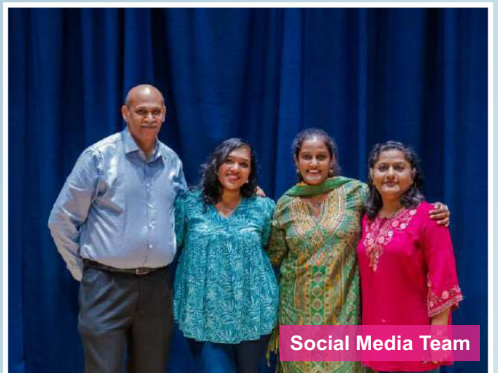
Social Media Team