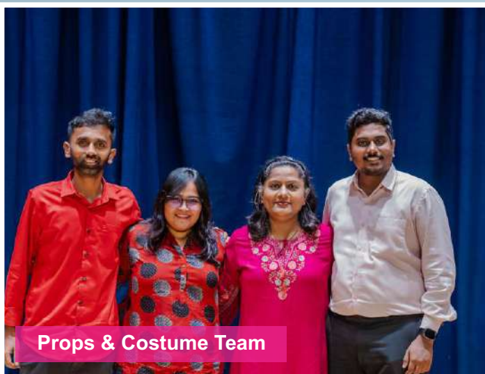
Props & Costume Team