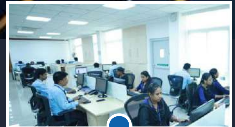
RADIANT CASH MANAGEMENT SERVICES LTD

Varied Business Interests One Mission.... Redefining Excellence