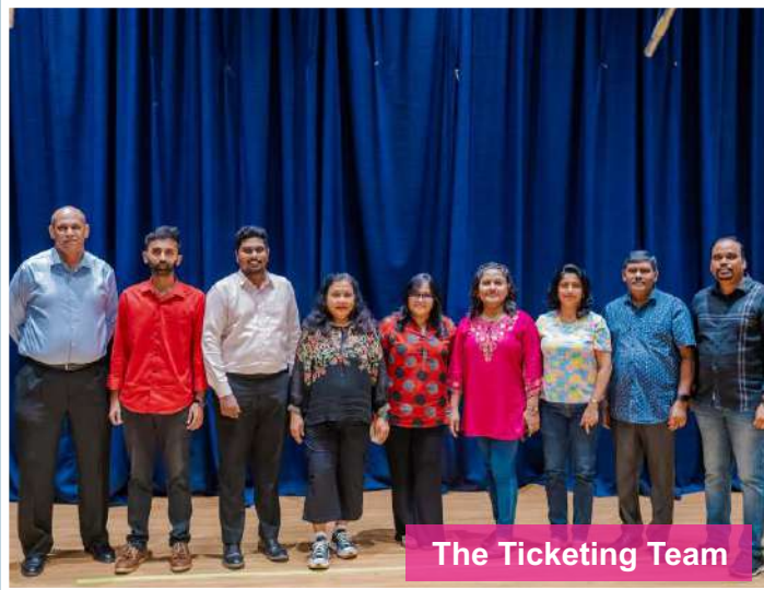
The Ticketing Team