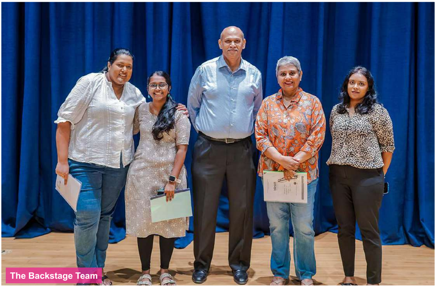
The Backstage Team