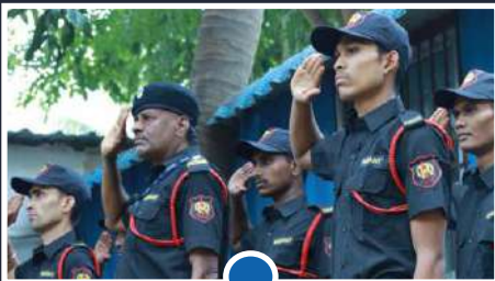
RADIANT PROTECTION FORCE PVT LTD