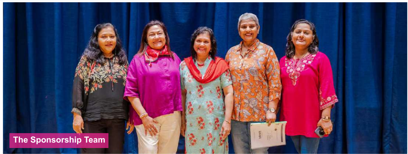
The Sponsorship Team