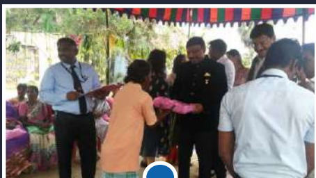
RADIANT's CSR INITIATIVES