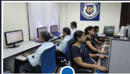
RADIANT BUSINESS SOLUTIONS PVT LTD