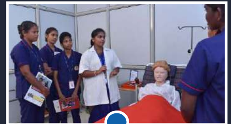
RADIANT MEDICAL SERVICES PVT LTD